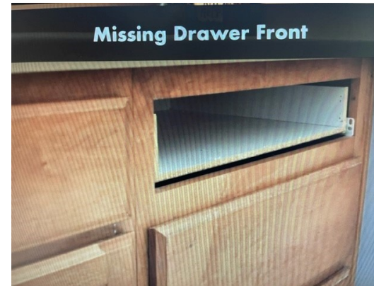
Picture #1 – Kitchen cabinets cannot be missing pieces or damaged in any way.